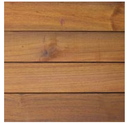
Tinted Stain & Sealer $13.45/LF