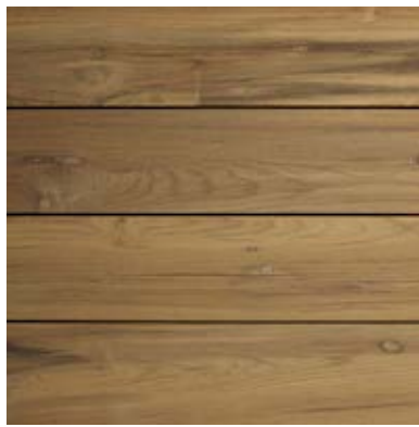
Clear Sealer $13.45/LF